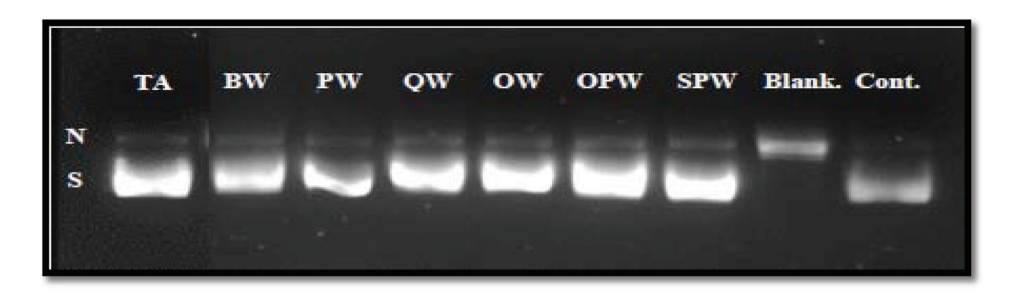
Figure 1. Agarose gel electrophoresis of inhibition of peroxyl radical-induced DNA scission by soluble wood extracts. N (nicked), S (supercoiled) DNA. TA, tannic acid; BW, banana wood; PW, pinewood; QW, quibracho wood; OW, oak wood; OPW, old date palm wood; SPW, seedling date palm wood.

Wood extracts as unique sources of soluble and insoluble-bound phenolics